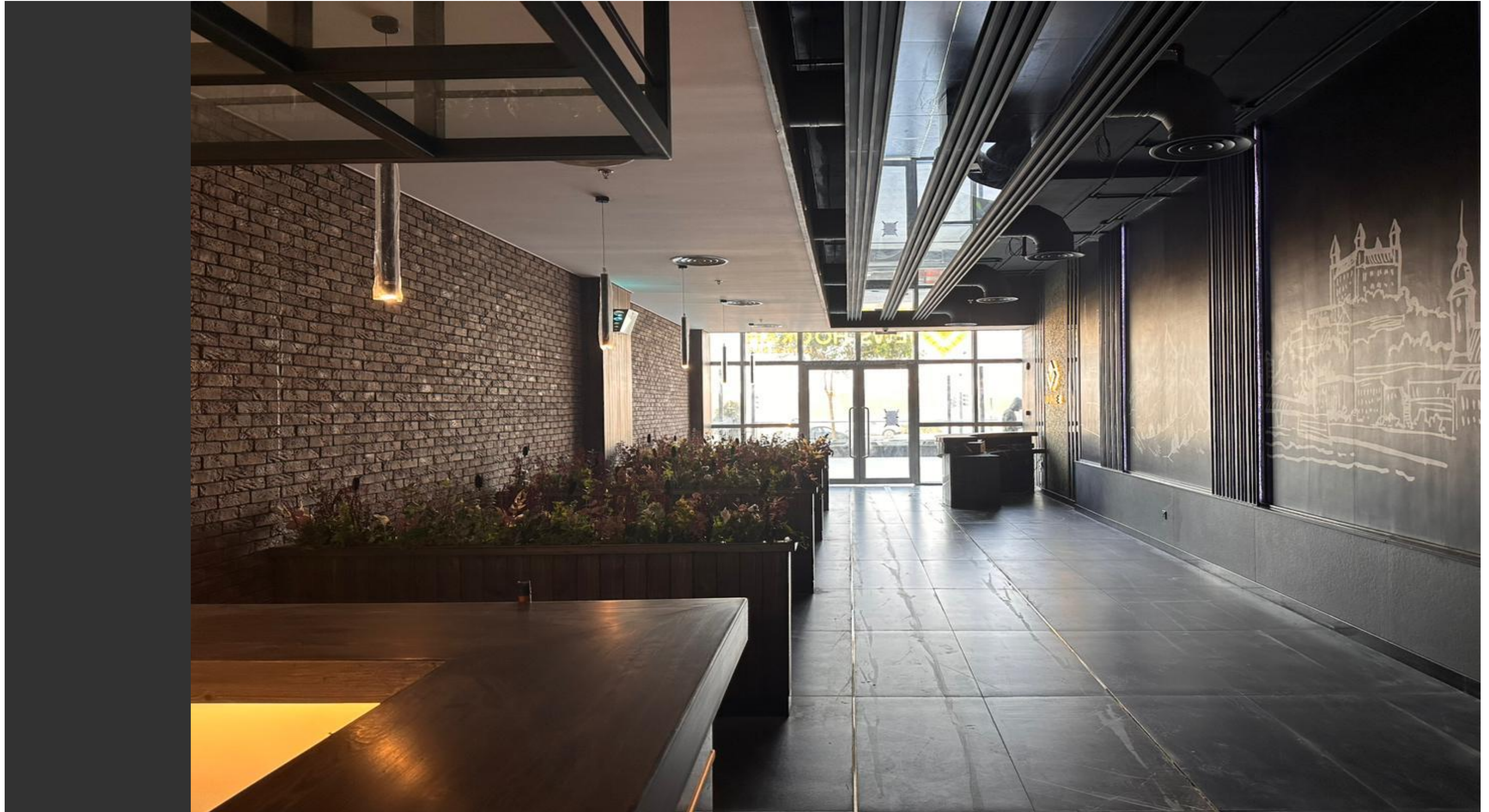
Wide Views Contracting Est.