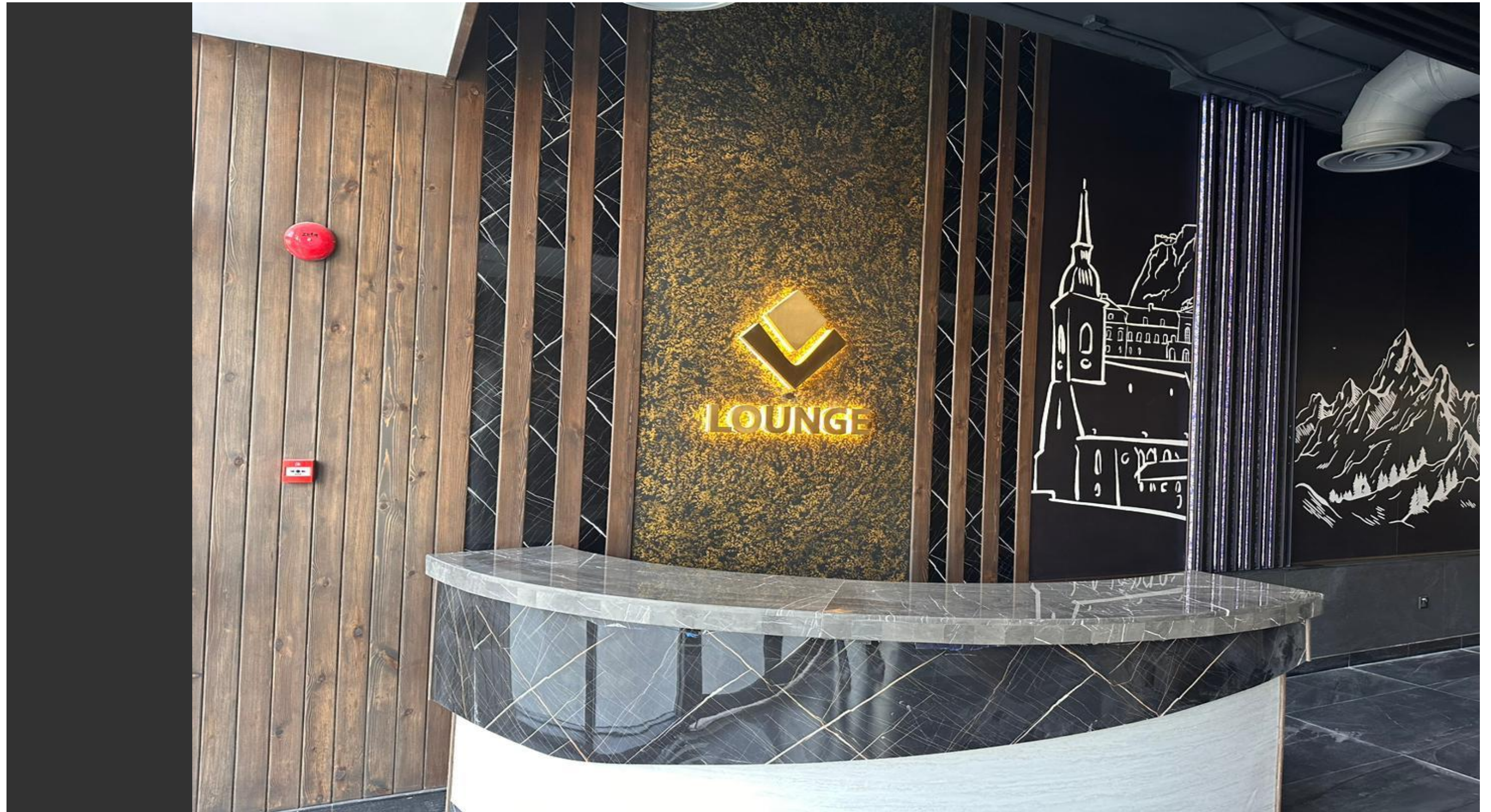
Wide Views Contracting Est.