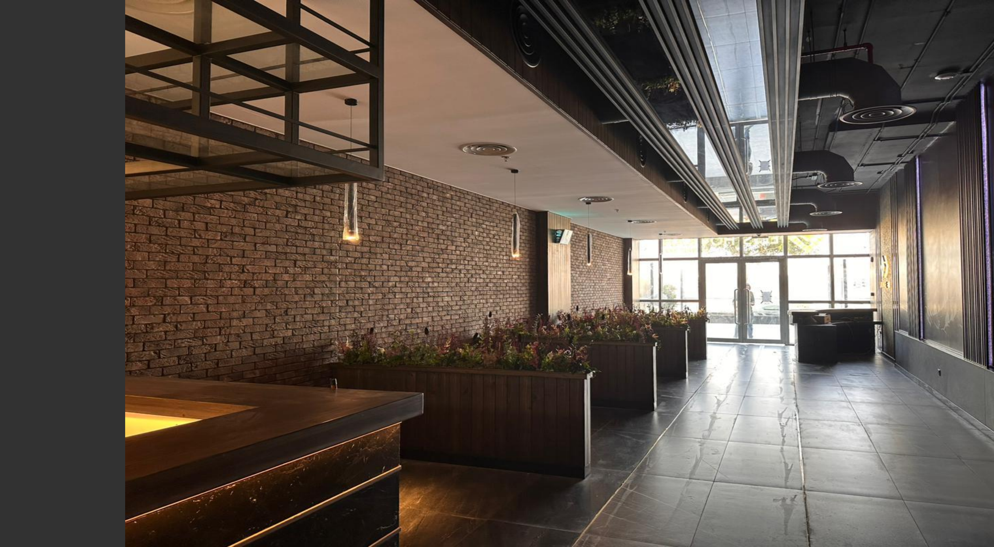
Wide Views Contracting Est.