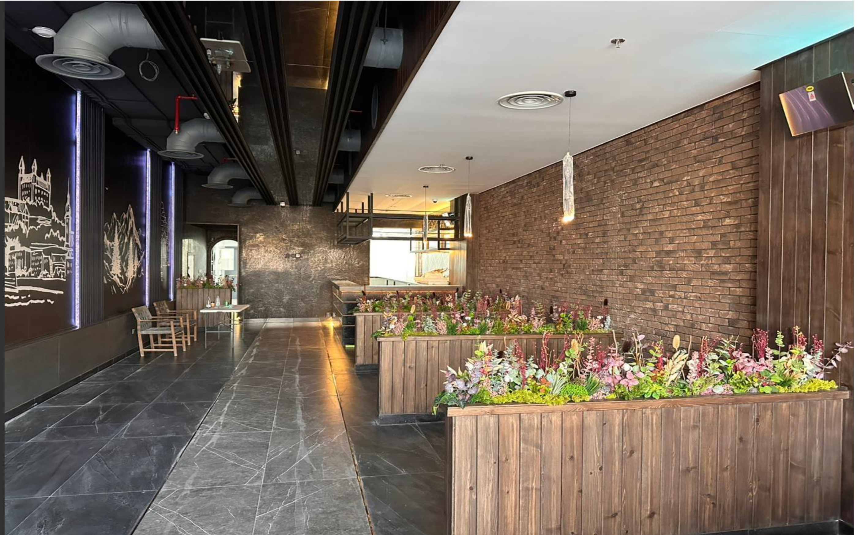
Wide Views Contracting Est.