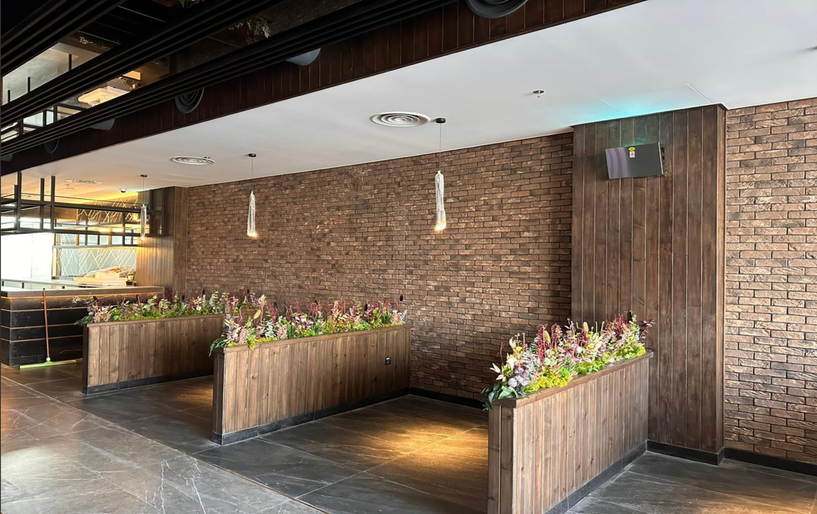
Wide Views Contracting Est.