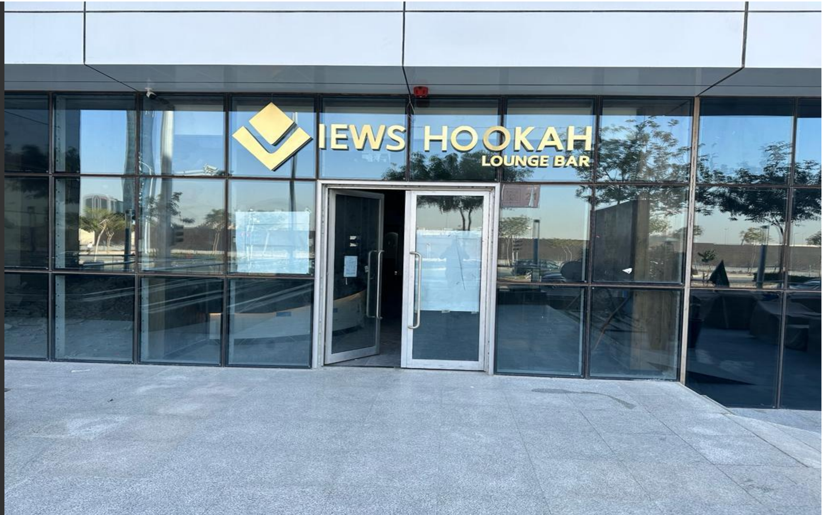
Wide Views Contracting Est.