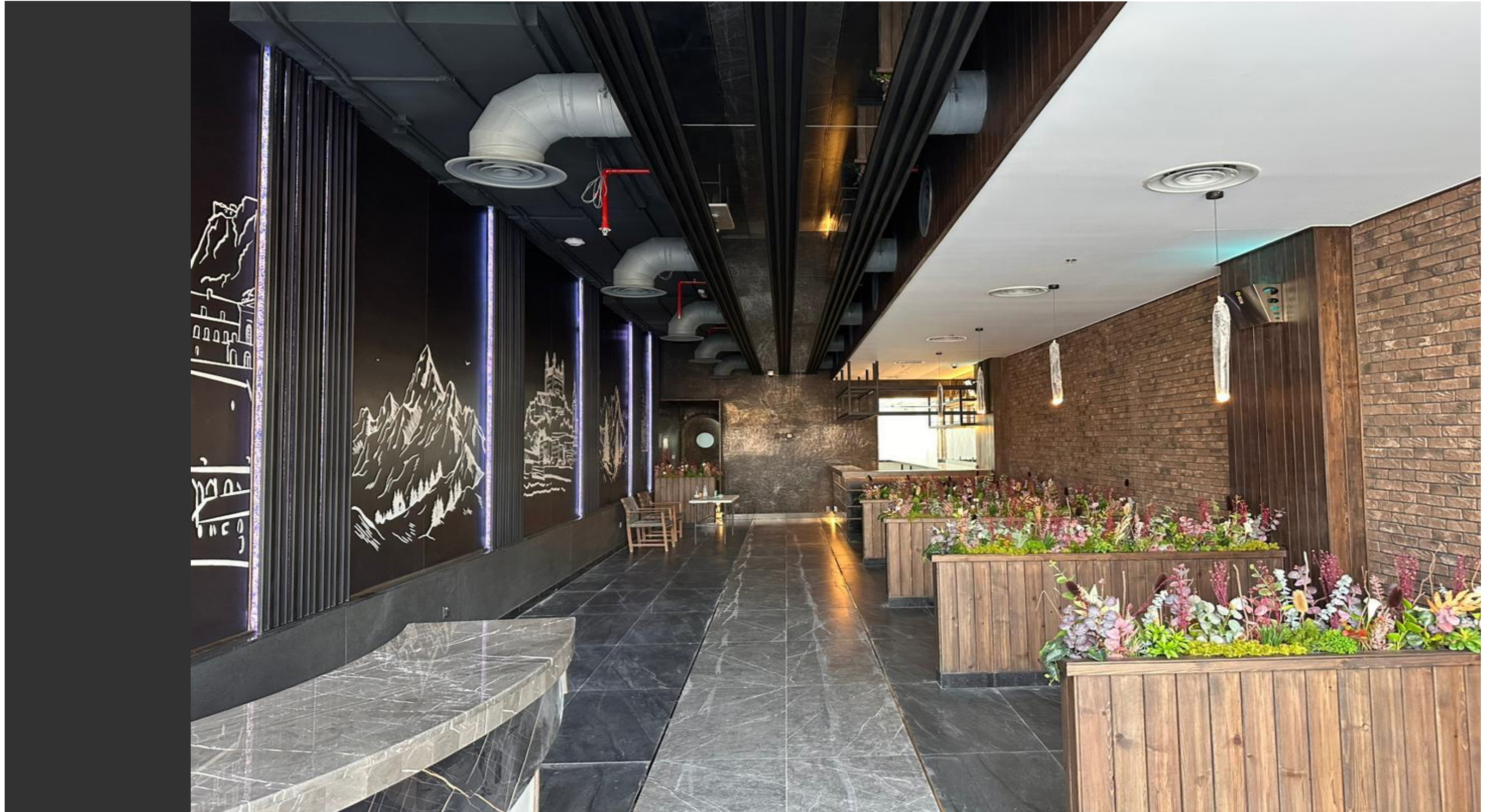
Wide Views Contracting Est.