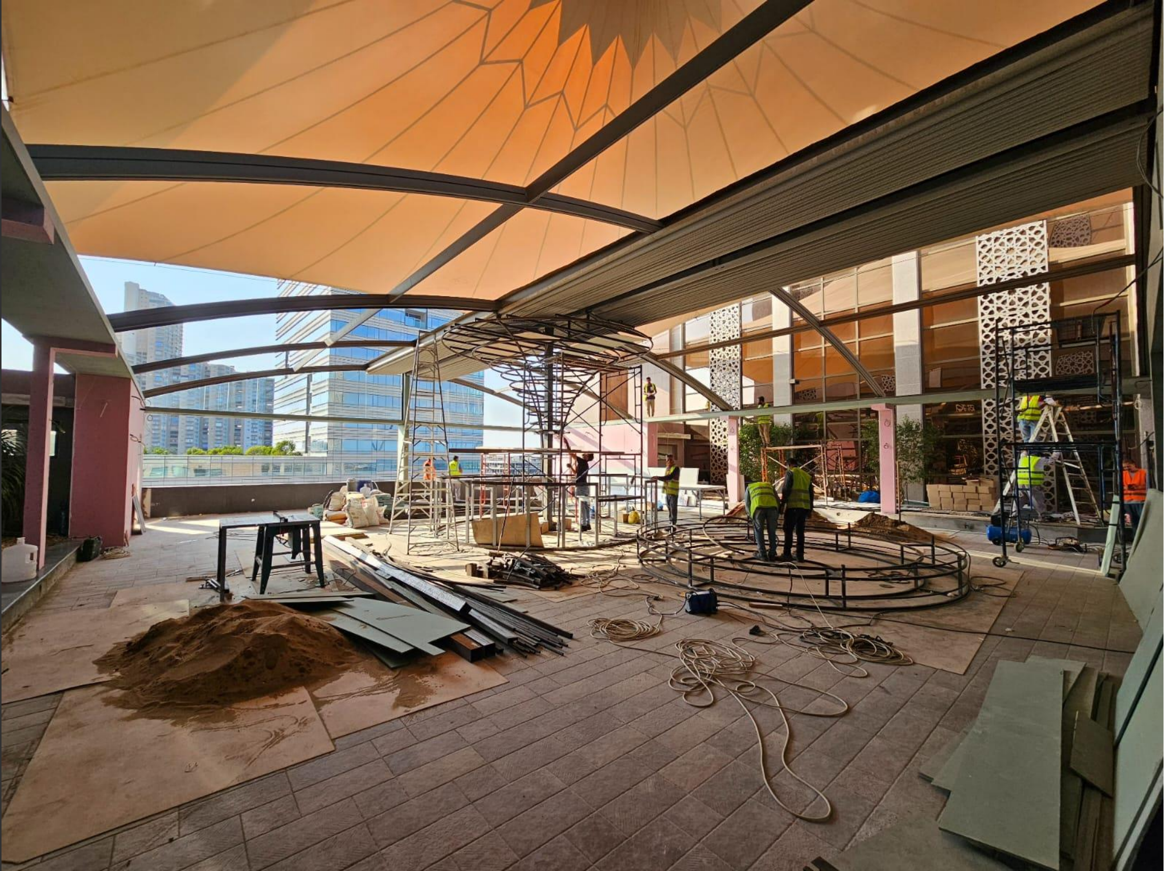
Wide Views Contracting Est.